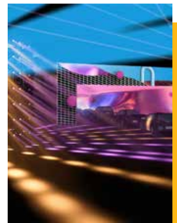
Drive Through Lights: @eamotion_live, Instagram

Quite literally turning concerts on their side, Ukrainian rock group O.Torvald performed on a rooftop opposite the Bratislava Hotel in Kiev, Ukraine. The audience was situated on the various balconies of the hotel, allowing them to witness the concert, and not be a terribly far distance away from the stage while still being socially distant. This method also allows for the performers to see their entire audience in a vertical sense, but causes some trouble on the production side as you do not want to blind the audience with lights or lasers. This method of concert going has picked up some traction across Europe.