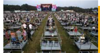
Drive in

Drive In Events seem to be the new normal in the United States for the current future. These events are held in large parking lots with every third parking spot open to park in. This allows for event goers to either sit on top of their cars, or sit next to their cars while still being socially distant from everyone else. While a majority of the events occurring so far have been concerts, there have been a few instances of theatre, such as Six: The Musical performing a 12 stop drive in style tour across Europe. While this method of events is currently popular, I hope it is only temporary. The stages set for these events are very tiny and the social distancing needed for not only people, but also their vehicles mean that unless you are the first 20-30 cars into the lot, you are likely watching the show from a screen a few hundred feet away from the stage. The performers are also looking out at a field of cars rather than people. A much better substitute for this is happening in Europe as well where instead of cars in parking lots, concerts are held in huge fields and each pod of people is given their own personal gated off riser. This is the closest thing to concerts before COVID.