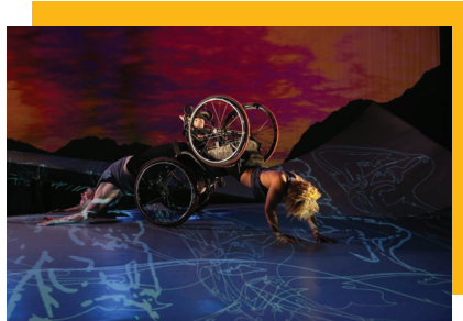
Lighting by Michael Maag

Remember: language is important! Some people prefer to identify with identity-first language (disabled people) vs people-first language (person with a disability) unsure of how someone identifies? Ask!